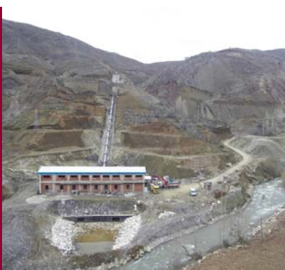
View to the power house