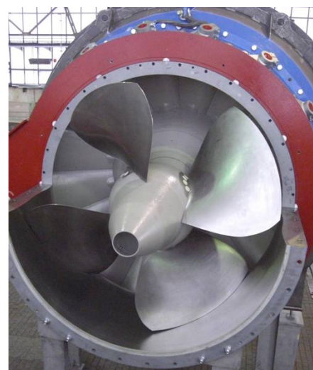
Bulb turbine during worksassembly

Technical data: 1 axial Kaplan bulb turbine Head: 10 m Turbine output: 2,502 kW