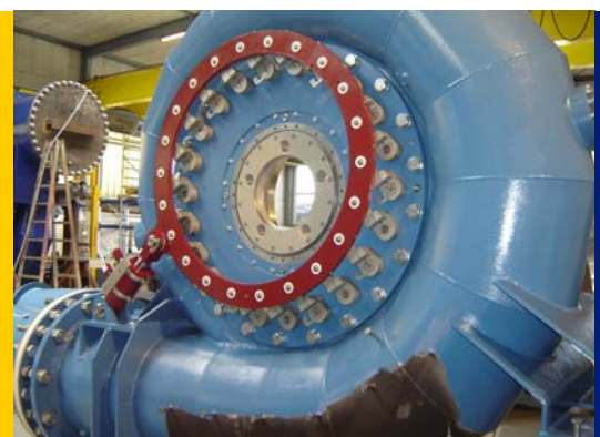
One of 2 Francis piralcase turbines