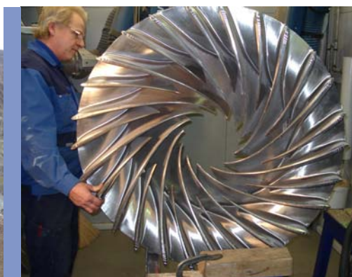
Milled fabrication of Francis runner in so called splitter blade design