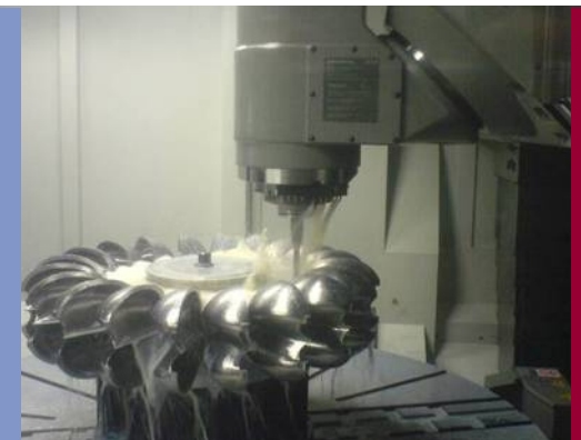
Milling of Pelton runner