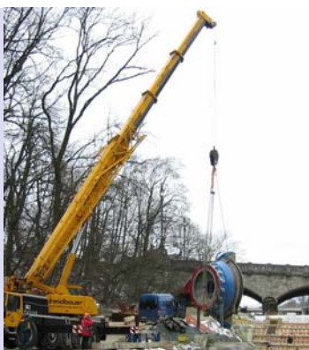
Installation of the bulb turbine