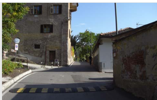
Access to the power house