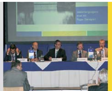
Customer event "Join Small Hydro Experience" 20. - 21. May 2010