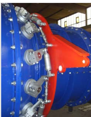
Kaplan turbine during works-assembly