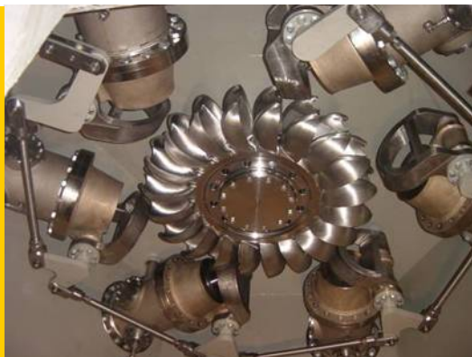
View to the 6-nozzle Pelton turbine