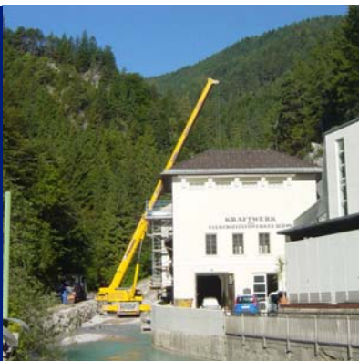
Installation of the E&M equipment